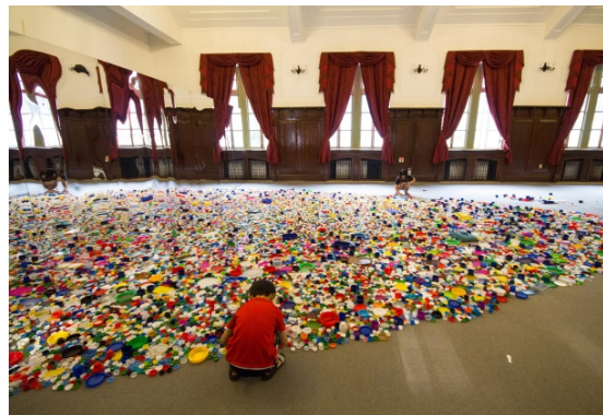
THE MANDALA OF FLOWERS 2014 / Plastic container lids / Courtesy: The artist