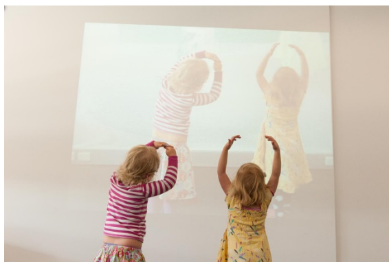
Children's workshop for Angela Tiatia Looking Back 2015