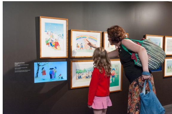
Installation view of the Kids' APT Drawing Projects 2006–12, presented as part of Kids' APT7