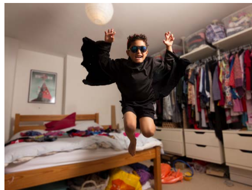
Behind the Mask (detail) 2015

Digital prints / Dimensions variable / Commissioned for APT8 Kids with support from the Tim Fairfax Family Foundation / Courtesy: The artist