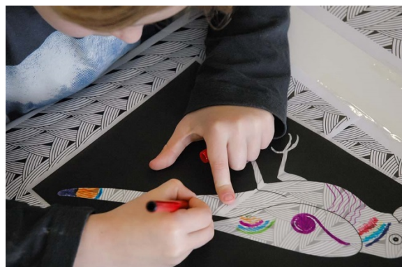
Children's workshop for Venkat Raman Singh Shyam The Woman and the Parrot 2015