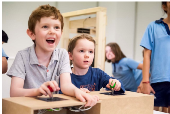
Children's workshop for UuDam Tran Nguyen Draw 2 Connect with License 2 Draw 2015